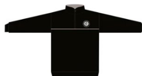
Boss Top $60