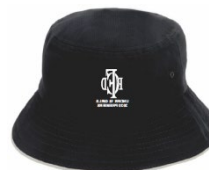
Bucket Hats $30