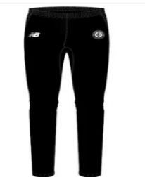
Track Pants $60