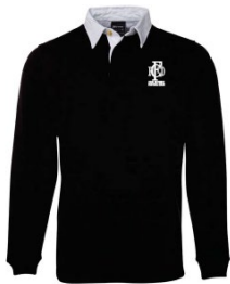
Rugby Top $65

It is expected that all Senior Players attend games in PDFC Attire.