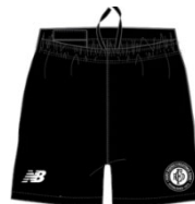
Casual Shorts $45